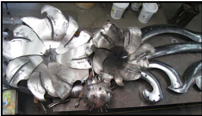
The stainless and carbon steel sculptures of "Moonflower" will be seen against screen walls adjacent to Oro Valley Marketplace's parking lot