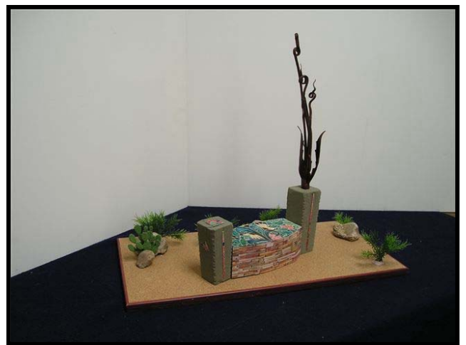
A model of a handcrafted tile bench and concrete pedestal with a plant-like metal sculpture