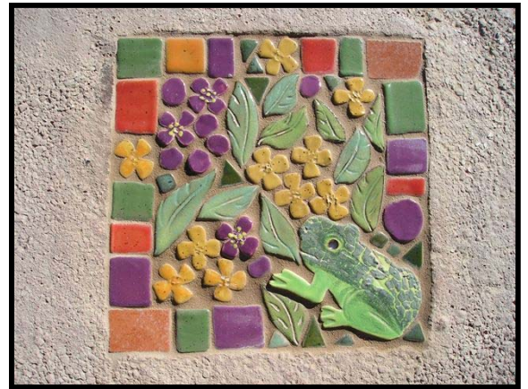
A tile spadefoot toad is surrounded by local flora